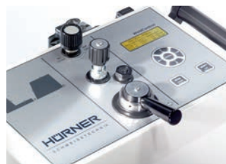
Front panel with GT keypad

All components are covered by the HÜRNER warranty.