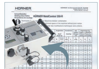
WeldControl jointing – no errors, no welding parameter look-up, but data recording